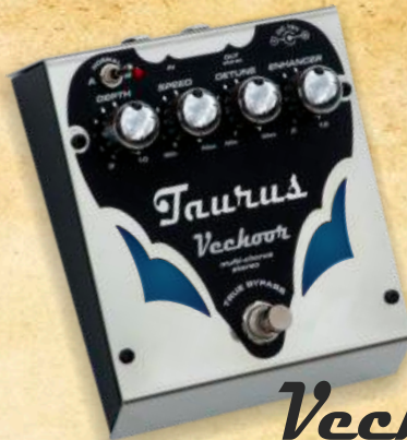
Vechoor Multi-Chorus stereo