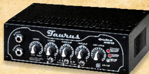
Qube-300 black line bass amp

450W/RMS Class-D Ultra-light and compact size. Dimensions: (H x W x D) 66x190x260mm Weight: 2.6 kg