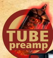
TH-CROSS silver line bass amp

450W/RMS, Two preamps: tube and transistor. Light weight and compact size. Dimension: (H x W x D) 66x483x190mm, Weight: 4.2 kg