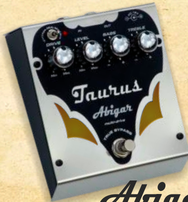
Abigar Multi Drive