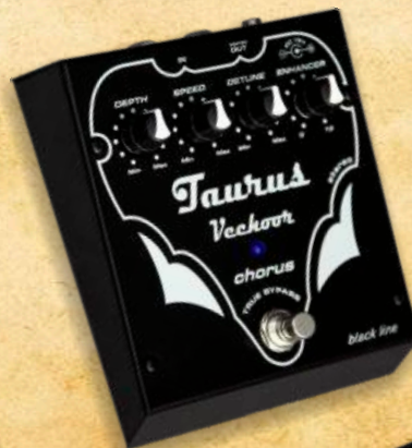
Vechoor Chorus stereo