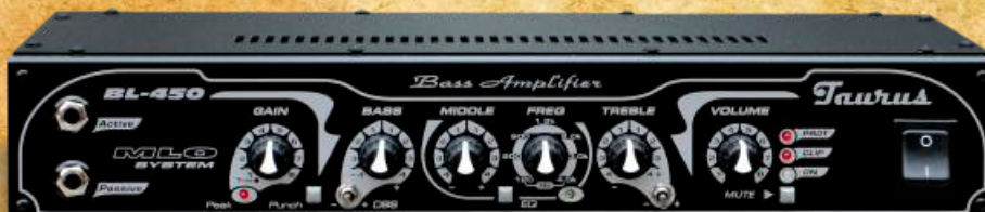
BL-450 black line bass amp

450W/RMS Light weight and compact size. Dimensions: (H x W x D) 66x380x180mm, Weight: 3.3 kg