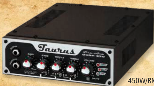
Qube-450 silver line bass amp

450W/RMS Class-D Ultra-light and compact size. Dimensions: (H x W x D) 66x190x260mm Weight: 2.6 kg