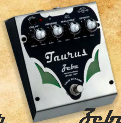
Zebu Reverb-Delay stereo