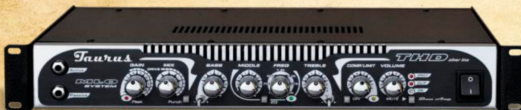
THD-450 silver line bass amp

450W/RMS, Two preamps: tube simulation and transistor. Light weight and compact size. Dimensions: (H x W x D) 66x483x190mm, Weight: 4.0 kg