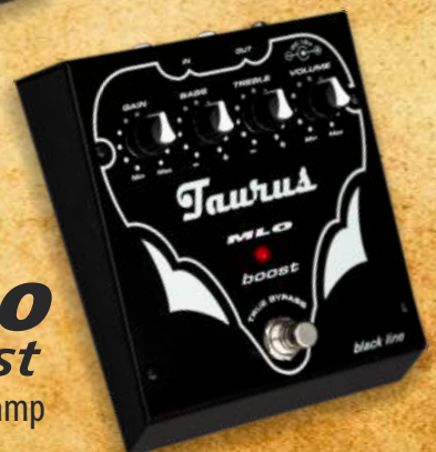
MLO boost Bass preamp