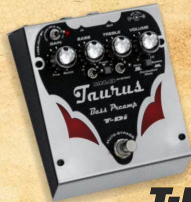
T-Di Bass preamp & Di-box