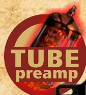
THD-450T silver line bass amp

450W/RMS, Two preamps: tube simulation and transistor. Light weight and compact size. Dimensions: (H x W x D) 66x483x190mm, Weight: 4.0 kg